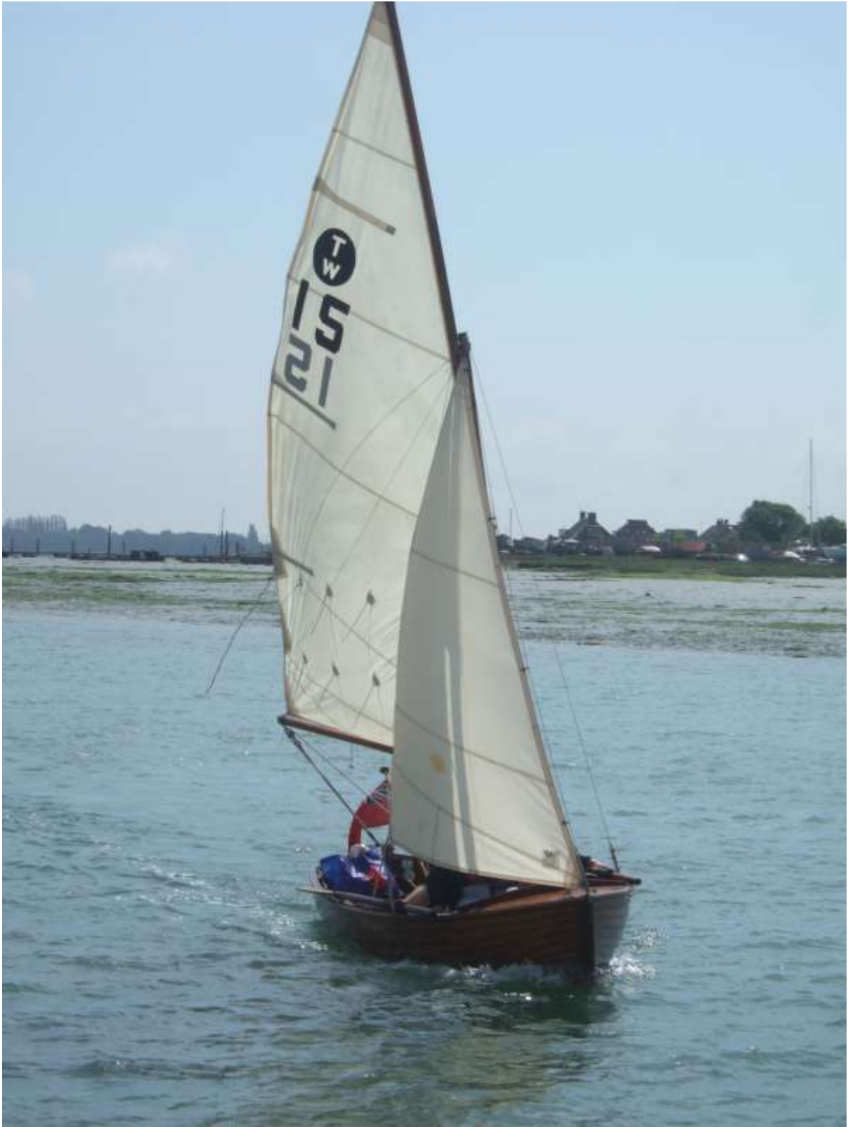
Luna under sail