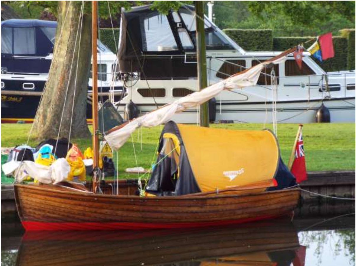
Hurley lock day 6