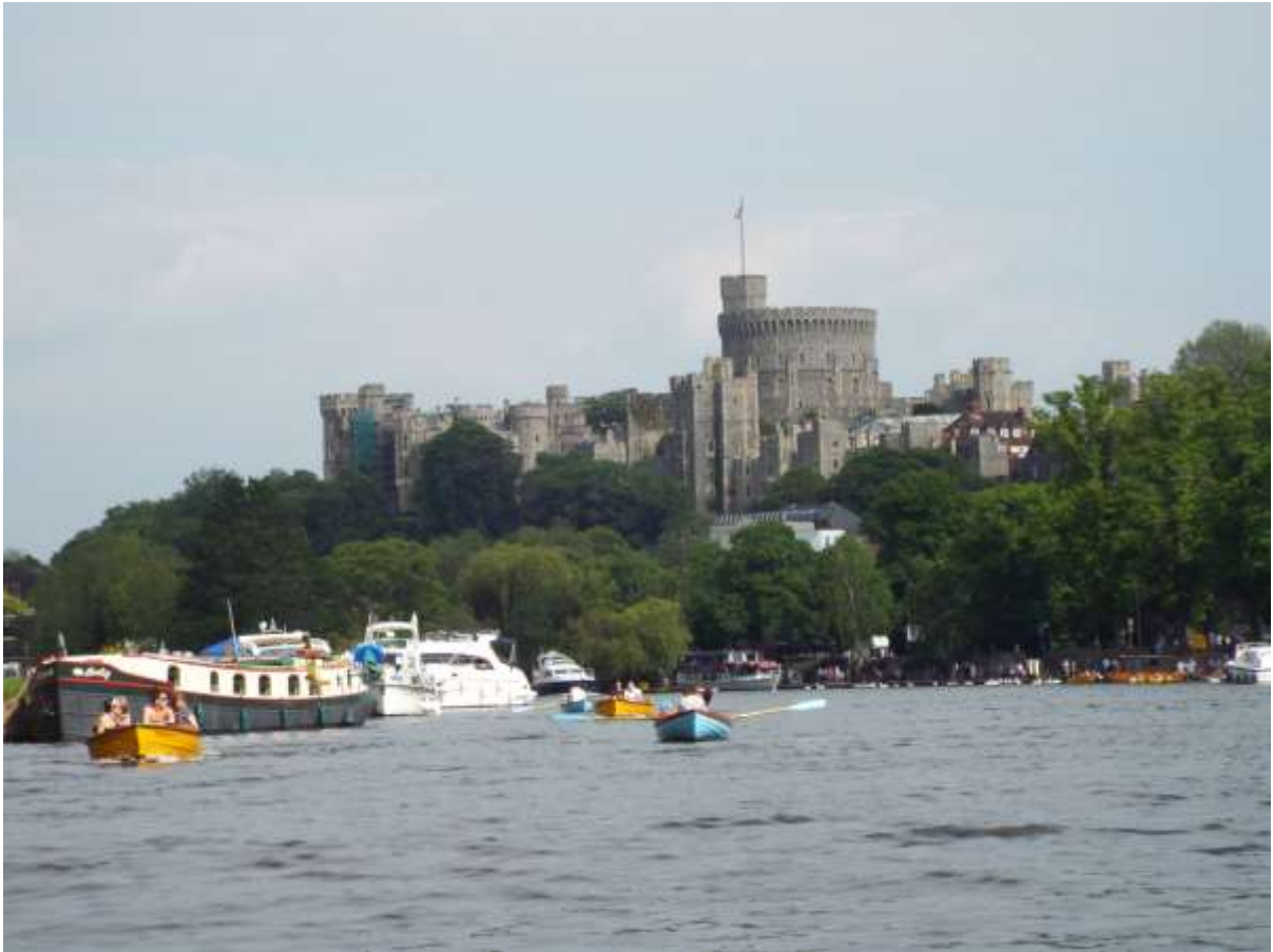
Windsor Castle day 6