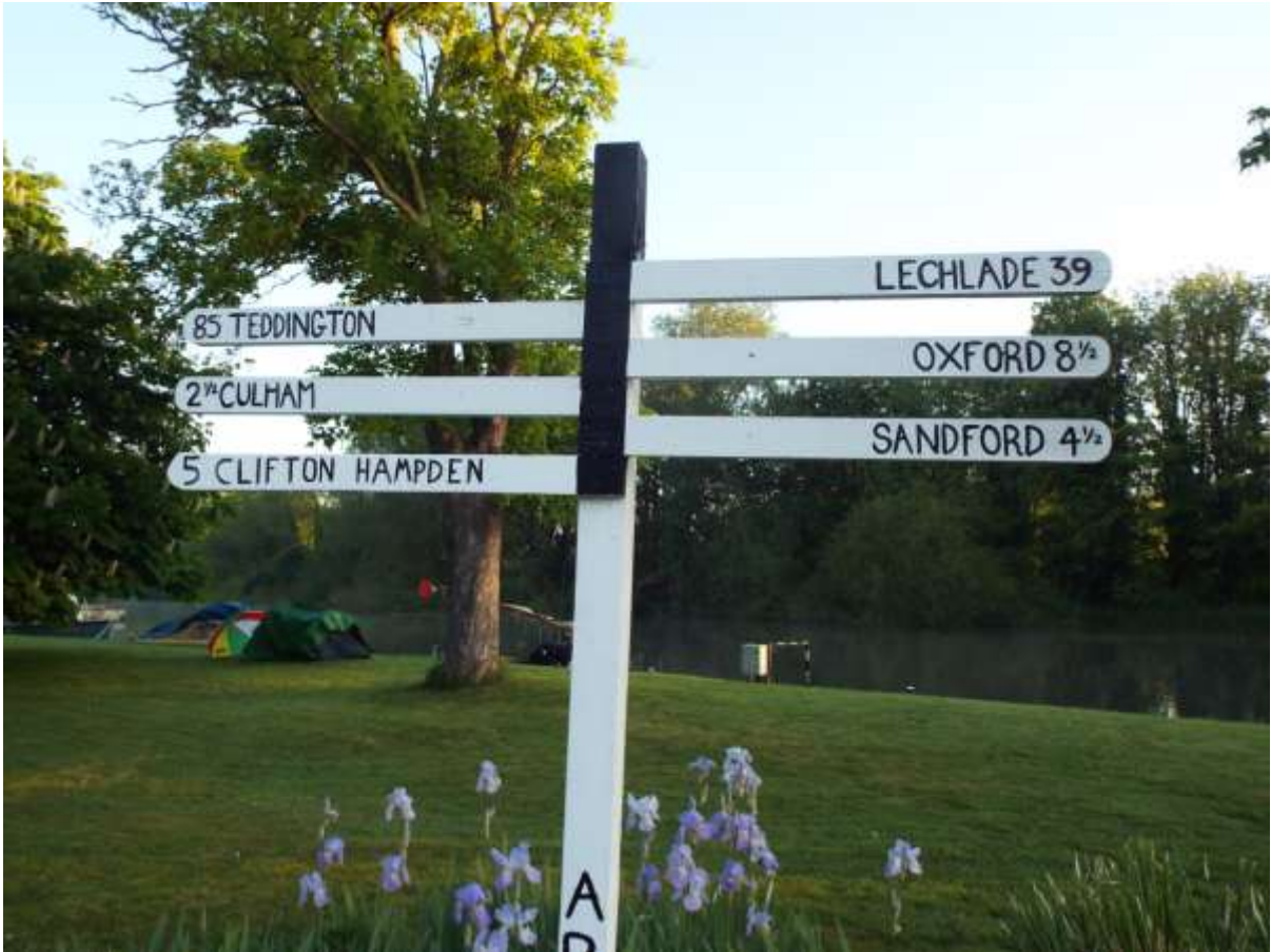
At Abingdon day 3