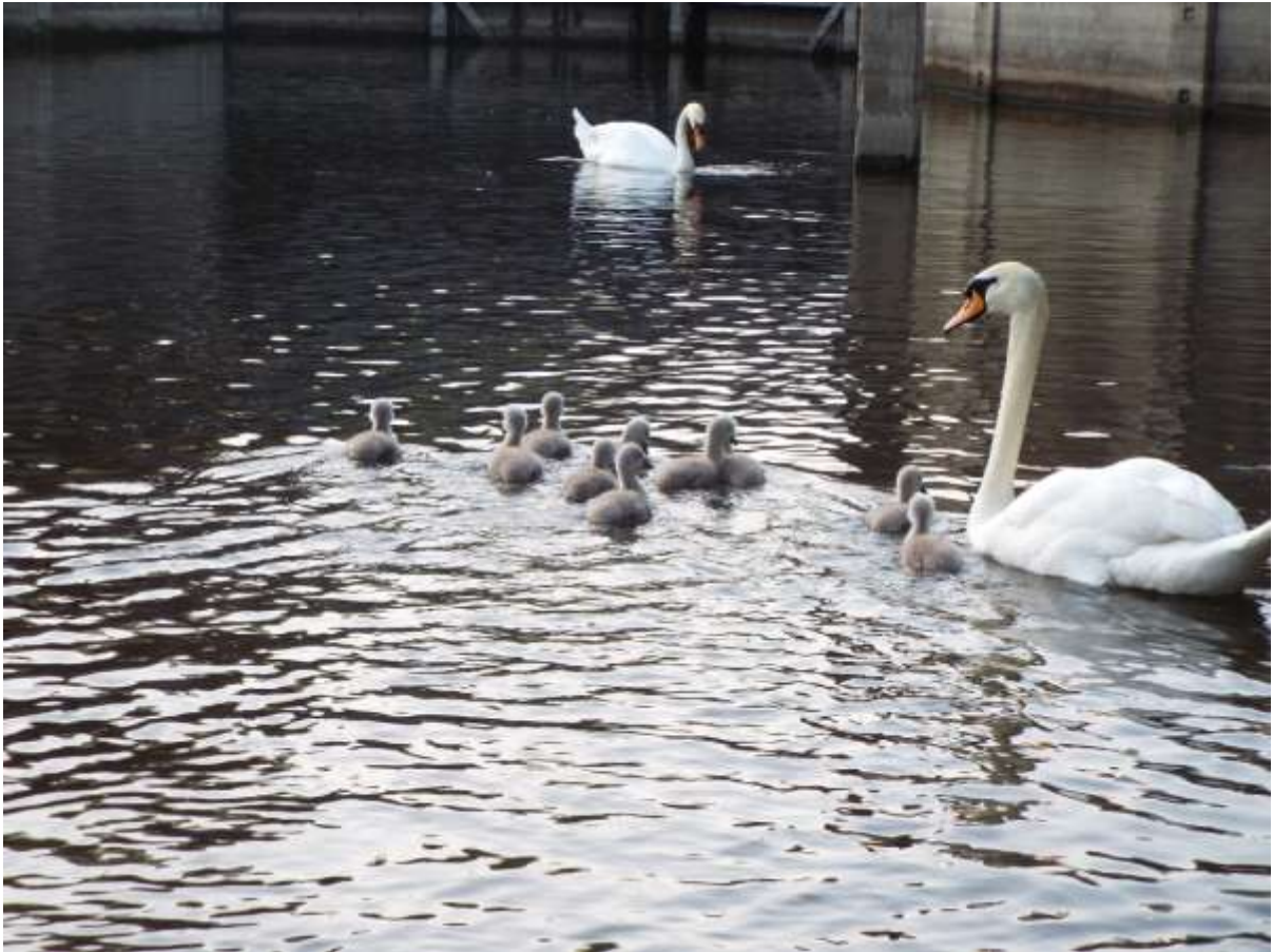
The Perfect Swan family