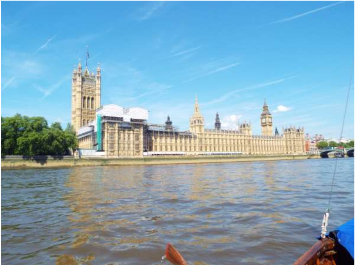
Houses of Parliament day 8